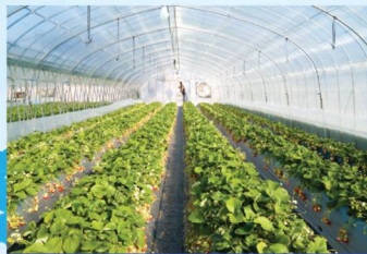
Nursery Green House