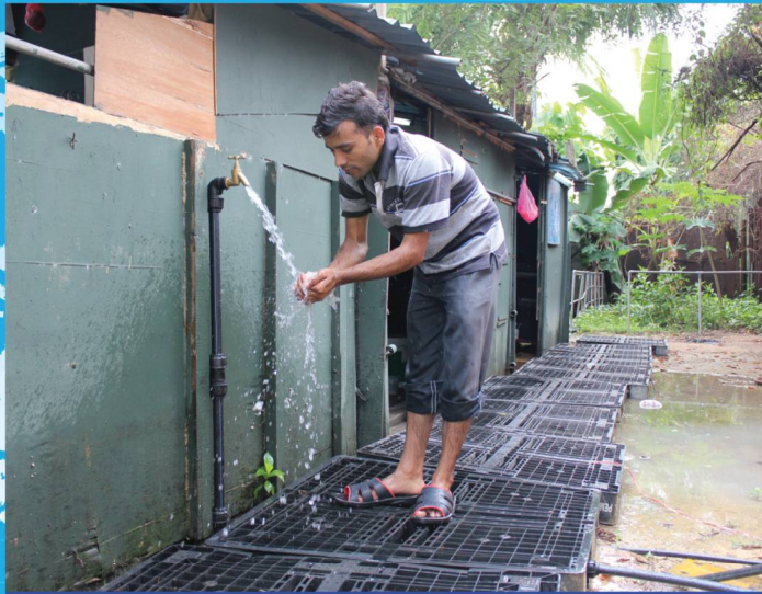
Potable Water Supply Pipeline