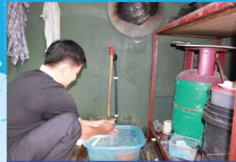
House Water Supply