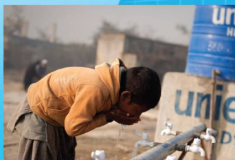
Rural Area Piping